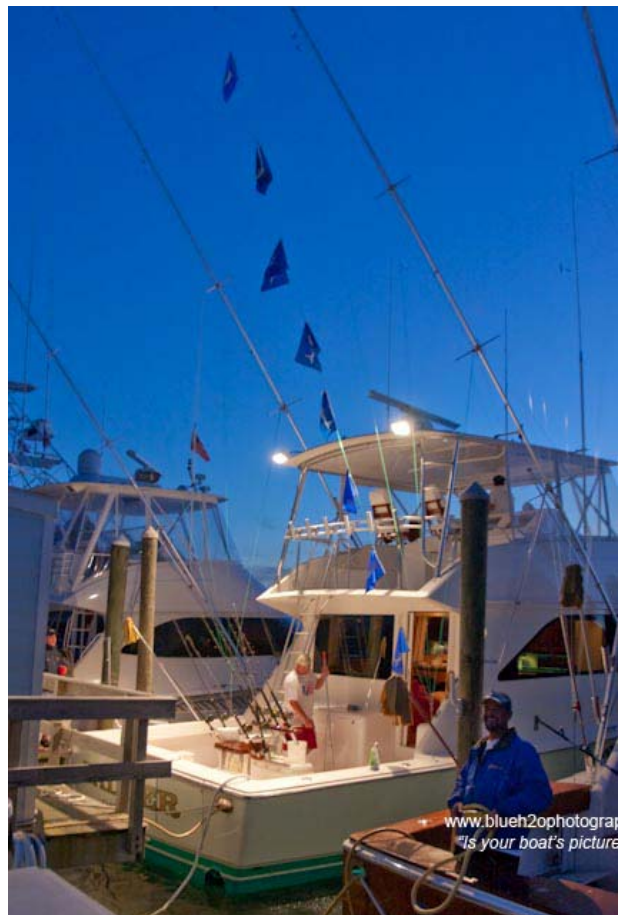
"Is your boat's picture"

Cape May Tuna and Marlin Club left Ocean City with the coveted Challenge Cup Award. Their team scored a total of 6,675 points. Over two day of fishing Cape May boats released 118 white marlin. The OC Marlin Club Team earned a total of 4,575 points and released 87 white and 1 blue marlin. Viking 68 , a Cape May Club boat, was the top boat with 1,575 points and a total of 21 white marlin releases.